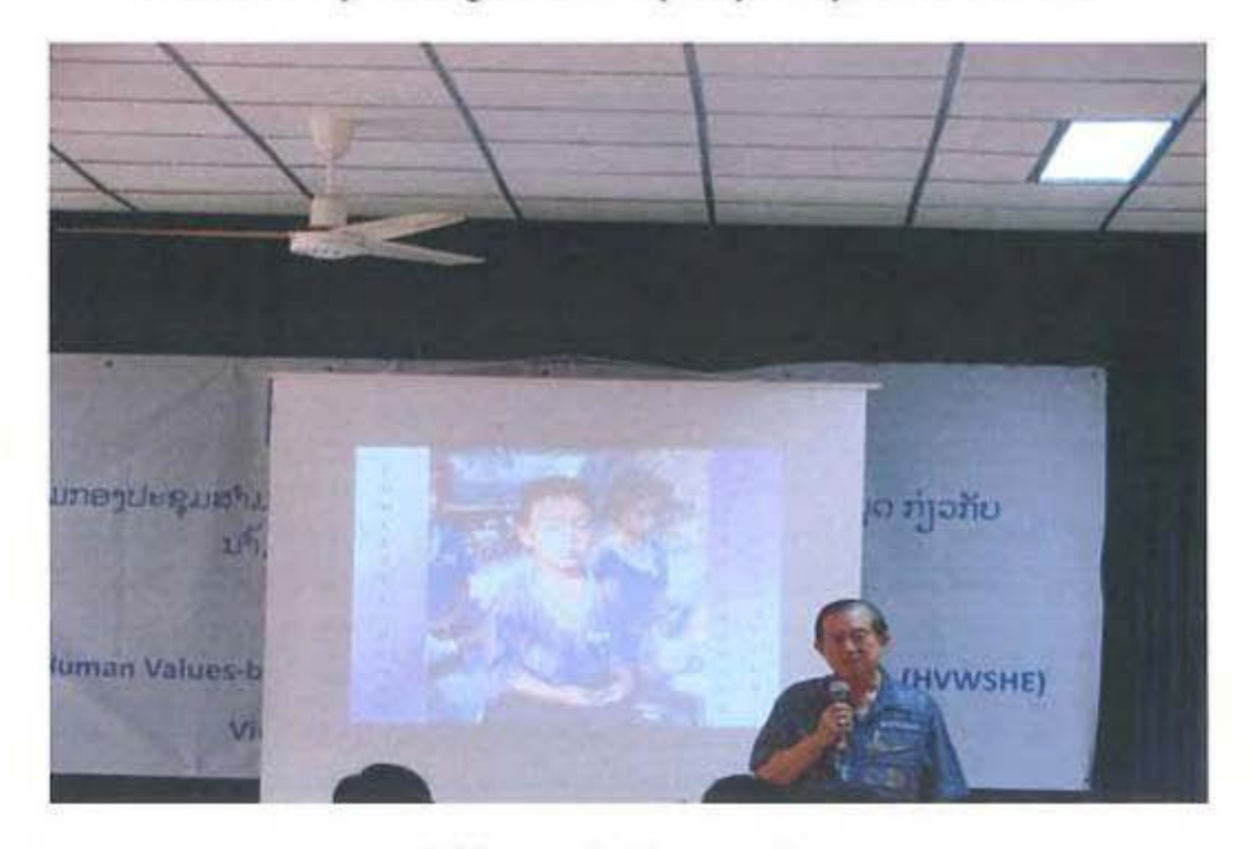
Exhibition at the Resource Center