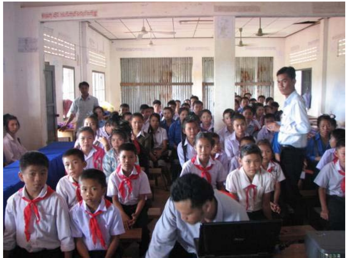
Students in the training in Daensavanh Primary School