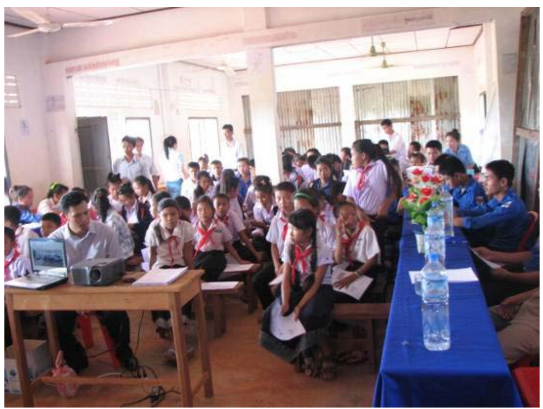
Students and teachers participants in the training