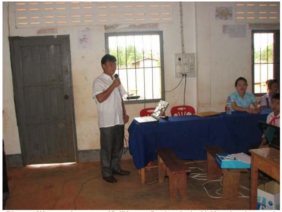
Director of Nampapa department of Bolikhamxay Province sharing his ideas about human value based water and sanitation