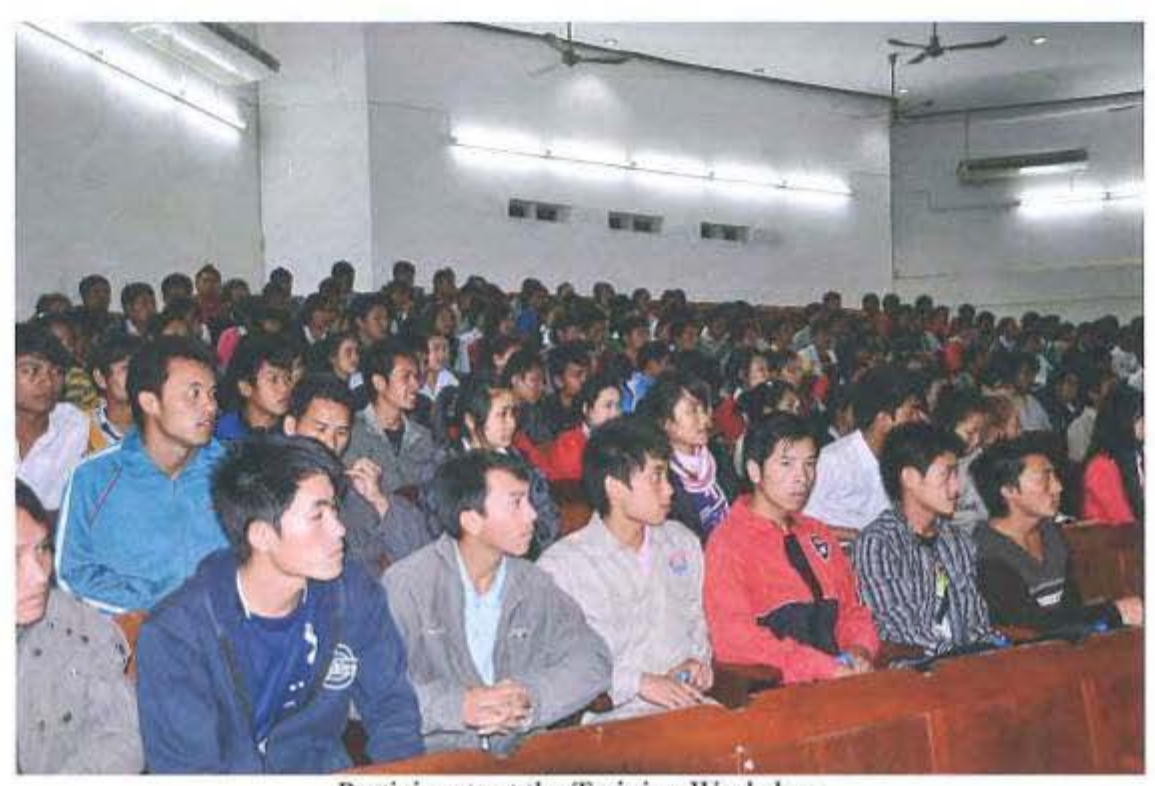
Participants at the Training Workshop