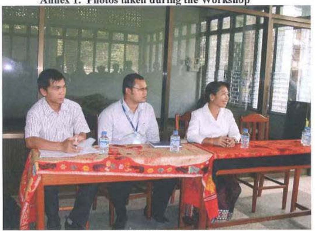
Opening of the Workshop

Annex 1. Photos taken during the Workshop