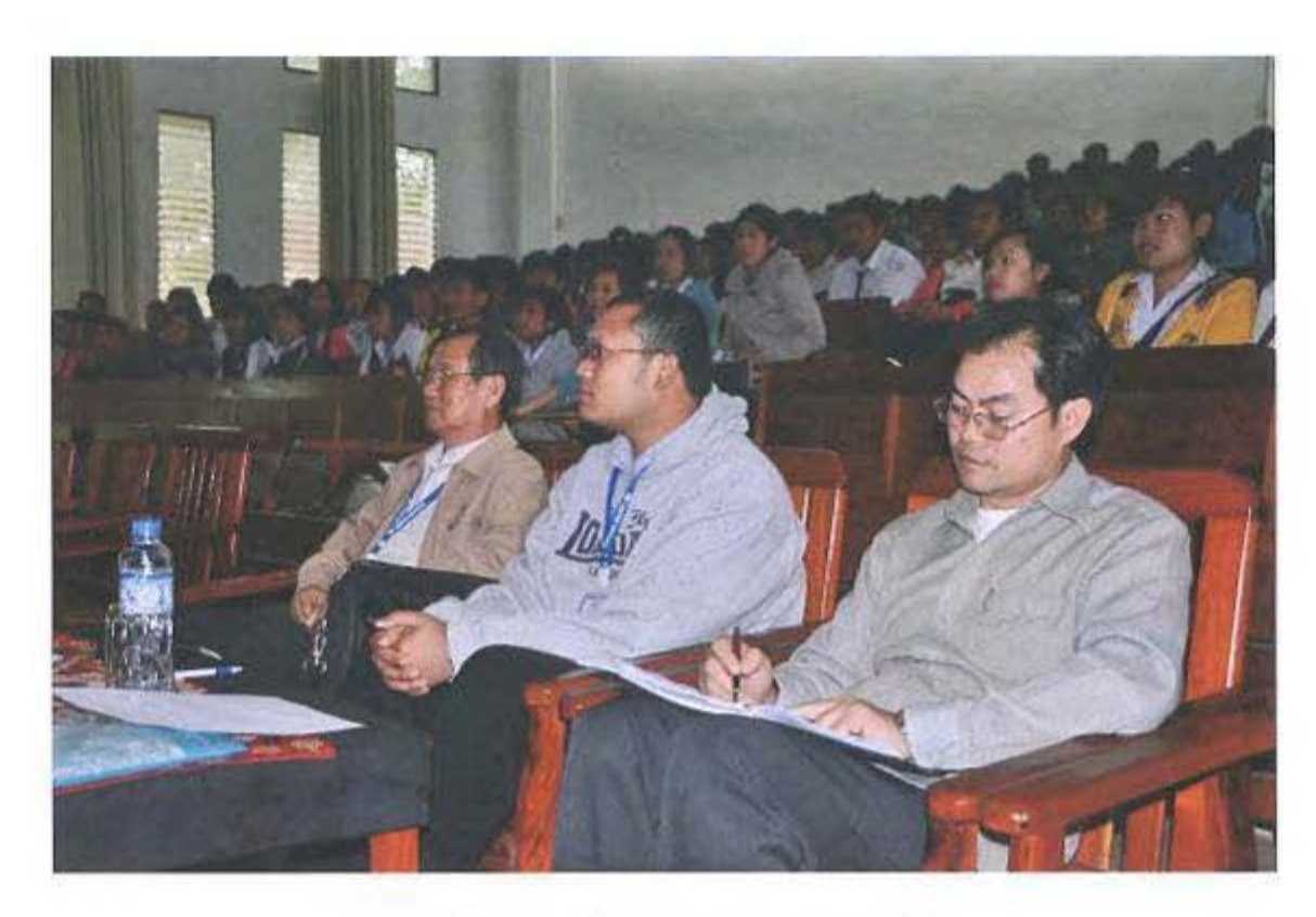
Participants of the Training Workshop